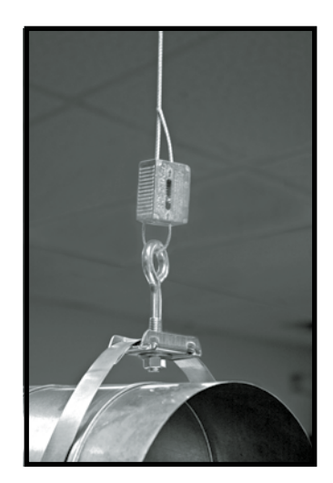
Spiral Buckle with eye bolt and the Dyna-Tite Wire Rope Suspension System