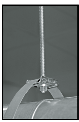
Spiral Buckle with threaded rod